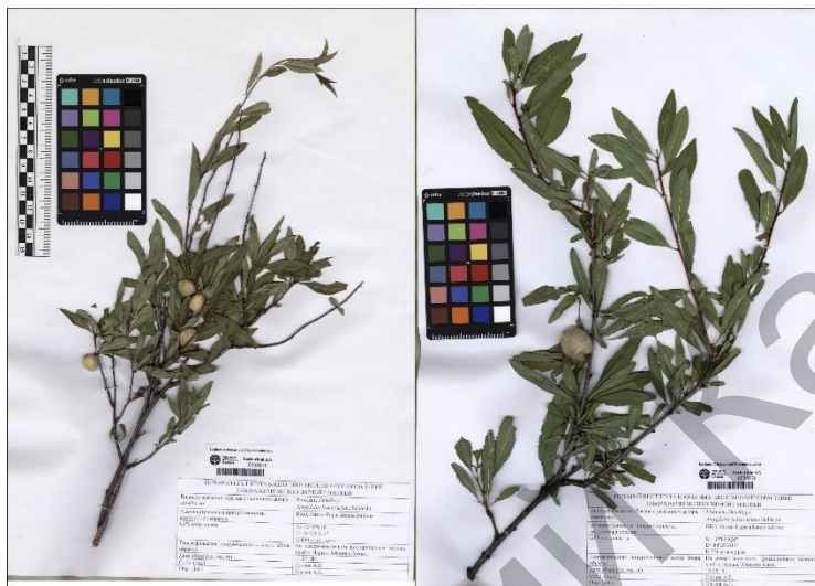
Figure 1. Herbarium samples of Amygdalus ledebouriana Schlecht. (IPBB) transferred to the herbarium fund in the Institute of Botany and Phytointroduction (Almaty)

The list of methods used in this work included analysis of different literature sources, scientific publications, laws, decree and legal acts directly or indirectly connected with the topic of research, studied object and its preservation on the state level. Samples collected on the territory of East Kazakhstan were used as the materials of the study.