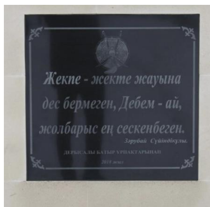
Figure 9. The Monument to Aydabol-uly Derbisaly batyr in the Aksu-Ayuly village, Shetsky district, Karaganda region (Photo taken by author, 2023)