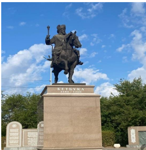
Figure 2. The Monument to Ketbuqa batyr in Zhezkazgan city

The next research is devoted to the monuments to batyrs in the Ulytau region, while the main dominant monument that will be considered in the study can be identified as the Ketbuqa monument (Fig. 2) located in the center of Zhezkazgan city, Garyshkerler Boulevard.