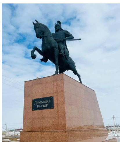
Figure 7. The Monument to Dauymshar batyr in the Baiganin village, Aktobe region

Zhidebay batyr Kozhanazar-uly (1713–1815), descended from the Argyn-Karakesek-Alteke family, was one of the leaders of the people's militia, which fought against the Dzungars in the XVIII century. His achievements, glorified by many legends, depict him as a batyr-orator, a famous commander and a biy. He participated in lots of battles, including the battles of Anyrakay, Kangshengele, Ailshek, Bayan, Nur, Tarbagatay, in the Western Altai, Shonshy and Kuldzha Alatau. The significance of Zhidebay batyr is confirmed by the fact that his name has become part of many proverbs. Therefore, Kazybek batyr noted "Where is a land like Sary-Arka, where is a man like Zhidebay" [24]. In addition to his military feats, Zhidebay batyr was a wise leader and an elder of his tribe. Currently, the monument of Zhidebay batyr in Balkhash town has become a symbol of a national unity.