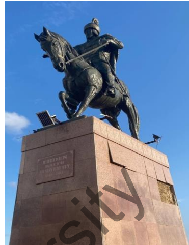
Figure 4. The Monument to Yerden Sandybay-uly in Ulytau district

The second monument erected in honour of Yerden Sandybay-uly (1808–1862) (Fig. 4) is located in the Ulytau district at the entrance to Ulytau village. The monument is made of bronze on a concrete pedestal. According to historical data, Yerden Sandybay-uly was a warrior, orator, diplomat, leader and the head of the region of Ulytau. Chokan Valikhanov described the warrior as an influential feudal lord from the wealthy Baganaly clan [16]. The warrior held the position of a volost ruler and a senior sultan for a long time, and took part in the expulsion of Kokand troops from Shu and Turkestan. In 1855, he participated as a delegate in the inauguration of Emperor Alexander II [17]. In his literary works, Aqan Seri praises the heroism of Yerden in the composition “Bimende Bolysqa”. His descendants installed the monument to the warrior as part of the “Rukhani Zhangyru” program.