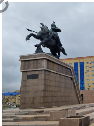
Figure 5. The Monument to Yeset baryt Koki-uly (Photo taken by the author, 2022)

The second monument erected in honour of Yerden Sandybay-uly (1808–1862) (Fig. 4) is located in the Ulytau district at the entrance to Ulytau village. The monument is made of bronze on a concrete pedestal. According to historical data, Yerden Sandybay-uly was a warrior, orator, diplomat, leader and the head of the region of Ulytau. Chokan Valikhanov described the warrior as an influential feudal lord from the wealthy Baganaly clan [16]. The warrior held the position of a volost ruler and a senior sultan for a long time, and took part in the expulsion of Kokand troops from Shu and Turkestan. In 1855, he participated as a delegate in the inauguration of Emperor Alexander II [17]. In his literary works, Aqan Seri praises the heroism of Yerden in the composition “Bimende Bolysqa”. His descendants installed the monument to the warrior as part of the “Rukhani Zhangyru” program.