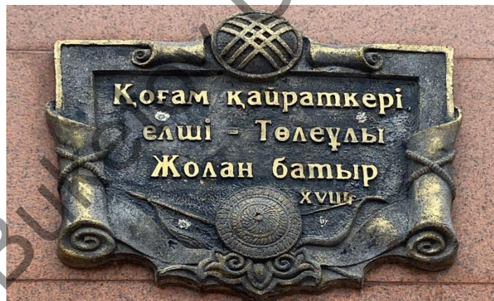
Figure 1. The Monument to Zholan batyr in Shymkent city

During the research in Shymkent city, we paid our attention to the monument of the batyr erected by descendants. One of the monuments is to Zholan Toleu-uly who at his time performed a military, leadership, peacemaking, educational and diplomatic functions in Kazakh society (Fig. 1).