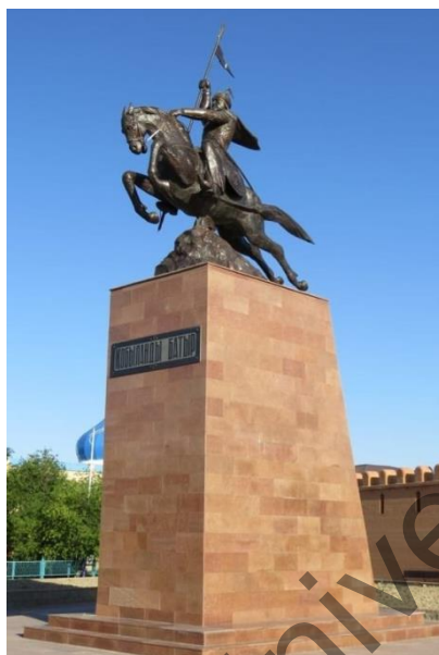
Figure 6. The Monument to Kobylandy batyr in Kobda district, Aktobe region

against the Volga Kalmyks and the second is the struggle for the freedom of the Kazakhs against the Dzungarian invaders. Yeset batyr also participated in the Battle of Bulanty and in the Battle of Anyrakay, he carried the banner as part of the pollination of the Younger Zhuz. For his merits, in 1743, the tsarist government of Russia awarded the title Tarkhan [18]. The monument to Yeset Batyr Koki-uly is located in the Nur City area of Aktobe city (Fig. 5). The monument depicts a batyr riding a horse with a spear in his hand, ready to slay his enemies. A foundation was created to install the monument, which was funded by local residents and sponsors [19].