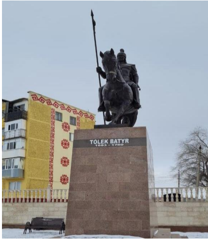
Figure 3. The Monument to Tolek batyr in Satpayev

monument to Tolek batyr originated from his descendants. The monument is located in a park that is a demanded leisure spot for locals. The bronze sculpture on horseback vividly conveys the warrior spirit of the batyr. The monument was erected as part of the “Rukhani Zhangyru” program in honour of the 30 th anniversary of the Republic’s Independence. The opening ceremony of the monument was attended by the Deputy Akim of the region, a group of aityskers and representatives of the region’s intelligentsia [15].