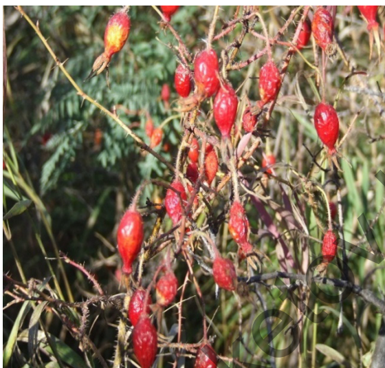
Figure 1. Fruiting of Rosa acicularis

2) Foothills of the Ubinsky ridge, Osinovsky pass, vicinity of the village of Zimovye. The population is located in the foothills of the Ubinsky ridge, near the village of Zimovye, with an area of 20 hectares along the road of the long Osinovsky pass in front of the village of Zimovye, with a length of 3 km, N50.31422; E82.85234, 795 m above sea level. The total projective cover is 12 %. The distribution of rose hips is diffuse and in continuous clumps under the canopy of tall trees: Abies sibirica Lindl., Populus laurifolia Ledeb., Betula pendula Roth., Sorbus aucuparia L., Sorbus aucuparia subsp. glabrata (Wimm. & Grab.) Hedl. The dominants of the herbaceous cover are represented by Dactylis glomerata L., Poa pratensis L., Festuca rubra L., Elymus repens (L.) Gould. (Fig. 1, 2).