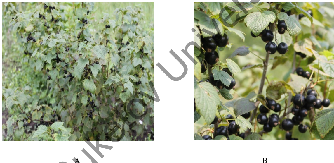
Figure 4. Fruit-bearing blackcurrant bush (A), blackcurrant berry cluster in the vicinity of Lake Markakol (B)

The bushes are spreading, 0.7–1.0 m high. The cluster is medium-sized, 4–6 cm, the number of berries in it is from 3 to 8 pcs., on average 5 pcs. The population is dominated by individuals with average berry sizes from 0.3 g to 0.6 g, the weight of the largest berry is 0.8 g. The berries ripen in the first ten days of August. The yield is from 0.5 to 2.0 kg/bush (Fig. 4).