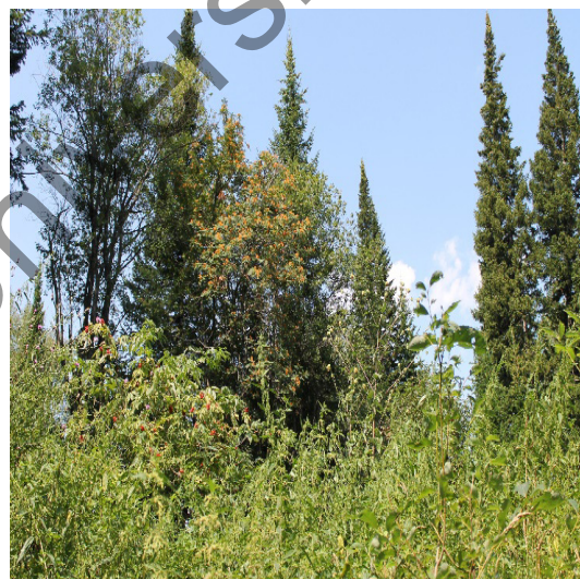
Figure 2. Fragment of the Rosa acicularis phytocenosis

Rosehip bushes are from 0.1 m to 2.2 m high. The bushes are in excellent condition, the maximum shoot-forming capacity is 4-5 zero shoots. The following differences have been established in the size of the hypanthia: length from 2.2 cm to 2.7 cm, width from 1.1 cm to 1.6 cm, weight from 0.97 to 2.26 g.