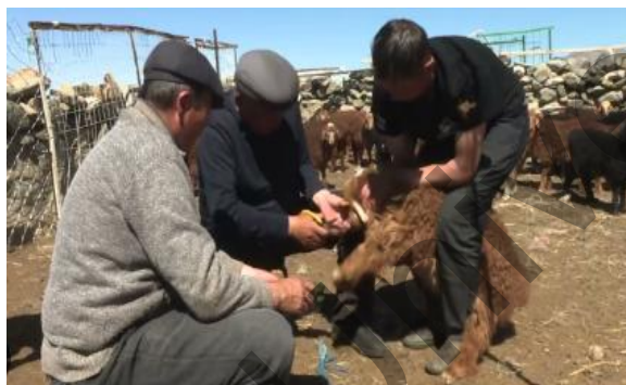
Figure 3. the moment of “branding” a lamb

In the early periods of nomadic warfare and throughout the history of the Turkic peoples, symbols were used in animal husbandry as identification marks on various parts of animals. The tradition of using symbols in Turkic culture spans from early periods till present and is considered an important phenomenon that has found its place in many elements of material culture. In addition, in order to regulate relations between neighbouring tribes, each tribe or clan displayed its unique characteristics by imprinting its specific symbol. In this way, the tradition of “imprinting symbols” became a significant mark representing the social structure and cultural values of the people. Along with the tradition of “stamp printing”, the tradition of “branding” animals, especially large or small species, to distinguish them from each other was also widespread. (The Figure 3 shows the moment of “branding” a lamb: Reference: https://www.youtube.com/watch?v=2O81f21JubU , taken from the YouTube channel).