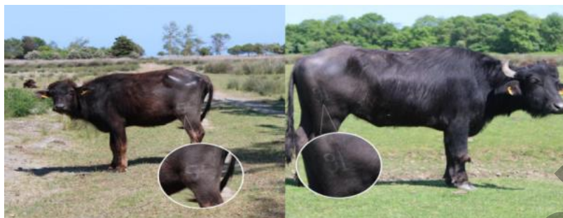
Figure 4. The symbol is printed cow. (Kızılırmak)

men of the household then prepare the animal for branding. The animal to be branded must be at least six months or one year old. In certain instances, adult animals may also undergo branding, particularly if they have been recently acquired. The preferred areas for branding are the dorsal region or the right and left hip area (Fig. 4: “A branded cow in the district of Kızılırmak near the city of Samsun, Republic of Turkey” from the article by Gül Seyfullah, 2024, page 123).