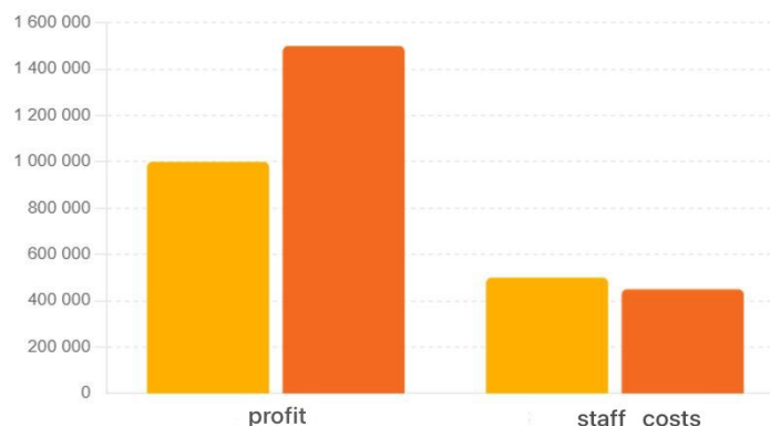
Figure 2. The impact of HRM on the financial performance of organizations

Note — compiled by authors based on correlation and regression analysis of organizational data