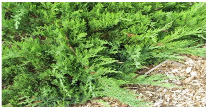
Figure 1. Cossack juniper

and flavonoids [6]. Juniper has a healing effect on the forest environment, releasing more phytoncides than other conifers. It also promotes the natural renewal of coniferous trees on the cutting sites. The toxic property of Cossack juniper excludes the possibility of its use in therapeutic conditions. A shrub growing mainly in woodlands or foothills [7, 8]. On the surface of the soil layer, the roots grow rapidly in horizontal conditions (Figure 1).