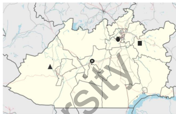
Figure 2. Map of the sampling point of Cossack juniper in the Karaganda and Ulytau regions

collected from four research zones (Karaganda, Zhanaarkinsky district, Karkaralinsky district, Ulytau district). In the course of the research work, a comparative morphological and anatomical study of the Cossack juniper was carried out on the following indicators: the length and width of the juniper, height and thickness; the length of the annual growth of shoots, the cross-sectional area, the size of the conductive bundle, the average diameter of the receptacle, the width of the epidermis; the size of the conductive bundle [12].