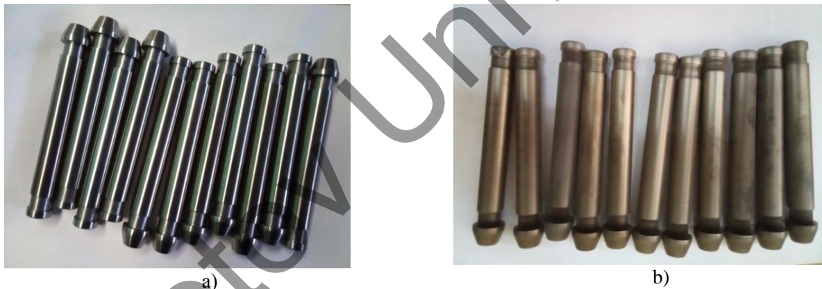
Fig.3. Stocks 35HGSA before (260 HV) (a) and after (820 HV) (b) nitriding

The nitriding process lasts 3 hours, after which the products are allowed to cool in a vacuum chamber for an hour and unloaded. The stocks before and after nitriding are shown in Fig. 3.