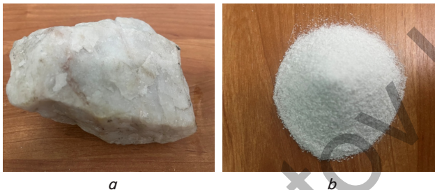
Fig. 1. Quartzite samples: a – quartz ore d=70.3 mm; b – crushed quartzite d=0.1\div 0.4 mm

The object of the study is quartzite from the Aktas deposit on the territory of the Karaganda region of the city of Zhezkazgan of the Republic of Kazakhstan (Fig. 1).