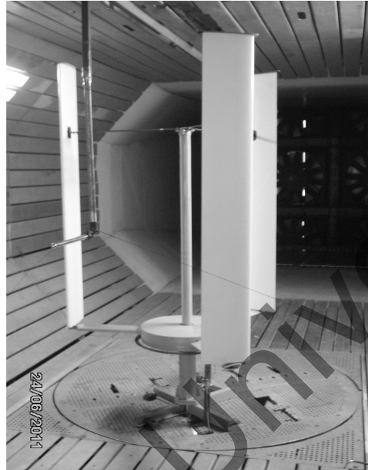
Fig.1. The wind turbine with controlled blades in the wind tunnel

The last prototype of the series of the wind turbines was created and tested in 2013-2018 and showed a stable and reliable performance during the tests in the wind tunnel, and the value of coefficient C_p was received equal 0.45. Darrieus type VAWT with straight controlled blades (Fig. 1) had the following parameters: blade length l_{\text{blade}} = 1.6 m, the chord length of the blade b = 0.25 m, the profile of the blade is symmetrical NACA 0015, the blade aspect ratio AR = l_{\text{blade}}/b = 6.4 , radius of blade rotation R = 0.7 m, the average diameter of the control track D = 0.4 m, the VAWT swept area S = 2Rl_{\text{blade}} = 2.24\text{m}^2 , the solidity \sigma = 3b / 2R = 0.54 . The blades were made of carbon plastic and one blade weighed 2.7kg.