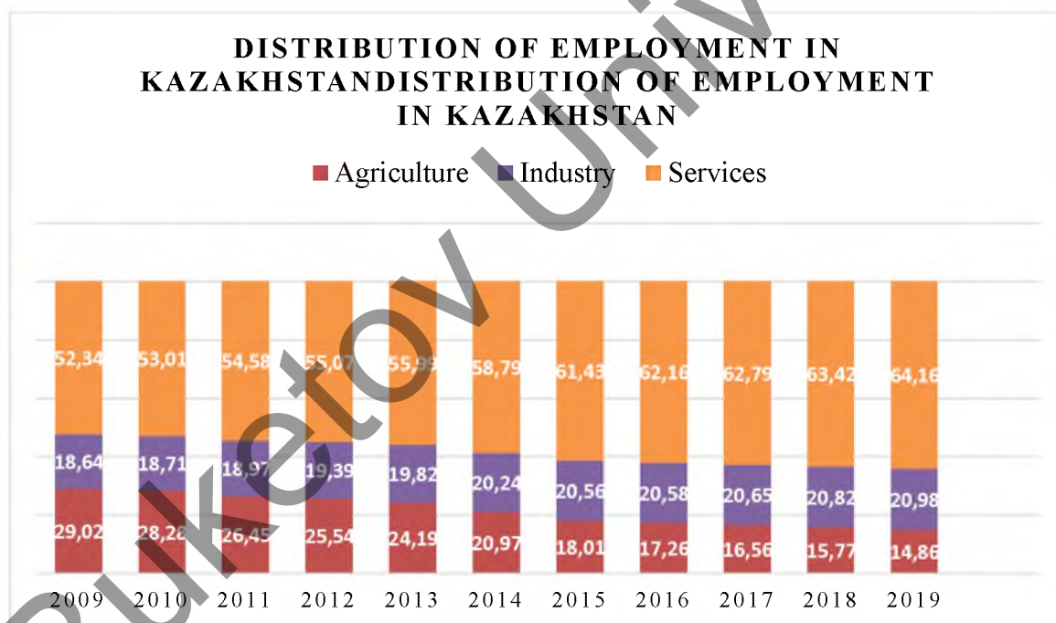
Figure 3. The distribution of employment in Kazakhstan according to economic sectors.

One sector, as it mentioned in Figure 3, that employs a considerable number of citizens of Kazakhstan and yet is overlooked is agriculture because the number of people it employs is reducing over the years instead of increasing. In 2019, 14.86% of people in employment belonged to the agricultural sector compared to 2009 (Statista, 2022). The government of Kazakhstan speculates that investing in agriculture will help to reduce unemployment, which is why it has invested in digitizing agriculture via the implementation of precision farming (Abdullaev et al., 2020). People in rural areas will benefit the most from improved agriculture because there is a high endowment of land resources and an unutilized pool of human capital.