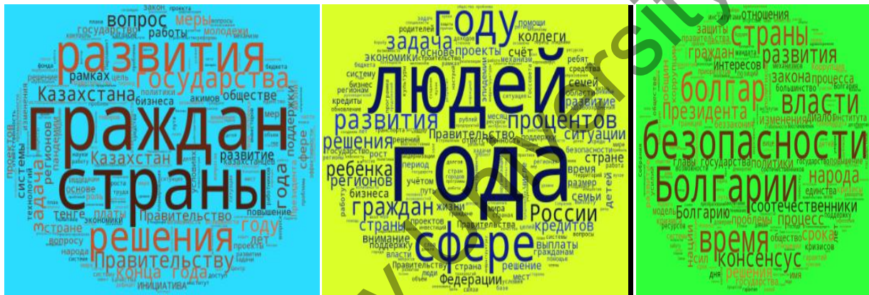
Figures 4–6. List of frequent nouns in the Addresses of the Presidents of Kazakhstan, Russia and Bulgaria

The Address of the Heads of States concerns the economy, politics, culture, education, etc. The key lexical units of different speech parts reflect political leaders' focus on specific topics. They represent the main idea of the president's speech. Thus, nouns were selected and presented in semantic clouds (Figures 4–6).