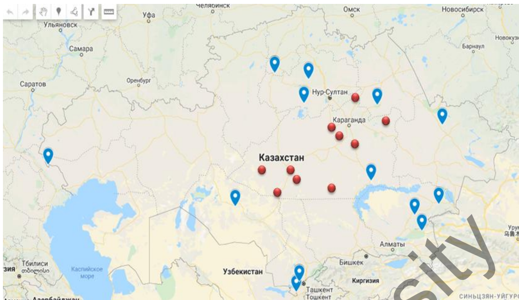
Figure 3. Map of Kazakhstan. Locations with the word qoňur in the names of hills and mountains (Google maps).

Note — Some hills and mountains are marked in red.