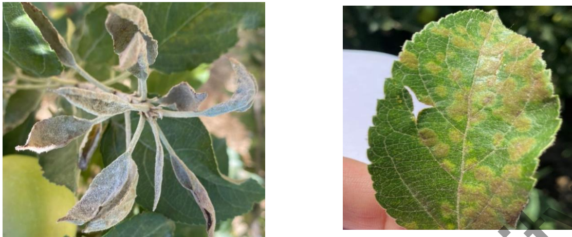
Figure 1. Leaf infection with powdery mildew and scab scored with 4