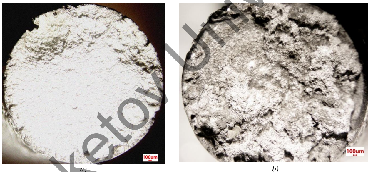
Fig.2. Corrosion damage on the end surface of NZ30K alloy (a) and silver alloyed NZ30K (b) samples after corrosion tests in Ringer-Locke solution.

It has been found that the sample subjected the greatest corrosion damage in the peripheral areas, i.e., in the places of the greatest plastic deformation of the alloy and the number of microdefects on its surface associated with the casting technology (Fig. 2, a).