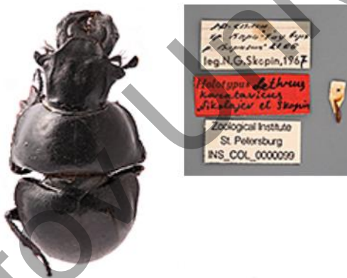
Figure 1. Collectors specimen INS_COL_000099 of Lethrus karatavicus Nikolajev et Skopin, 1971 with label. From the collection of beetles (Coleoptera) of ZIN RAS (after www.zin.ru/Animalia/Coleoptera ).

Zoological Institute of the Russian Academy of Sciences (ZIN RAS) houses an extensive collection of Coleoptera, comprising species of Geotrupidae. These beetles have long attracted the attention of collectors and nature lovers due to their bizarre appearance and biological peculiarities. Among them there is a specimen of a new species Lethrus karatavicus Nikolajev et Skopin, 1971, discovered by professor Skopin in the upper reaches of the Karachik River on the Kara-Tau Ridge (South Kazakhstan), and described by him together with the Kazakh entomologist G.V. Nikolayev (Fig. 1) [30].