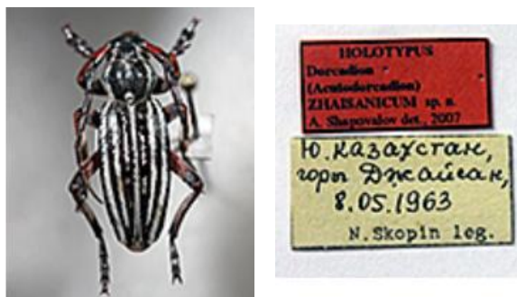
Figure 2: General view and label of the collection specimen INS_COL_CER_0000035 Dorcadion (Acutodorcadion) zhaisanicum Shapovalov, 2007 from the collection of beetles (Coleoptera) of ZIN RAS (after www.zin.ru/Animalia/Coleoptera ).

The species Amara (Cribrara) skopini Hieke is described as materials from Northwestern Kazakhstan, area of Lake Koskul. The species name was given by entomologist F. Hieke in honor of the collector and systematist N.G. Skopin. The holotype of this species is kept in the collection of ground beetles in ZIN RAS. The author's paratypes from the same habitat are presented in the Museum of Natural History (Berlin, Germany) [32].