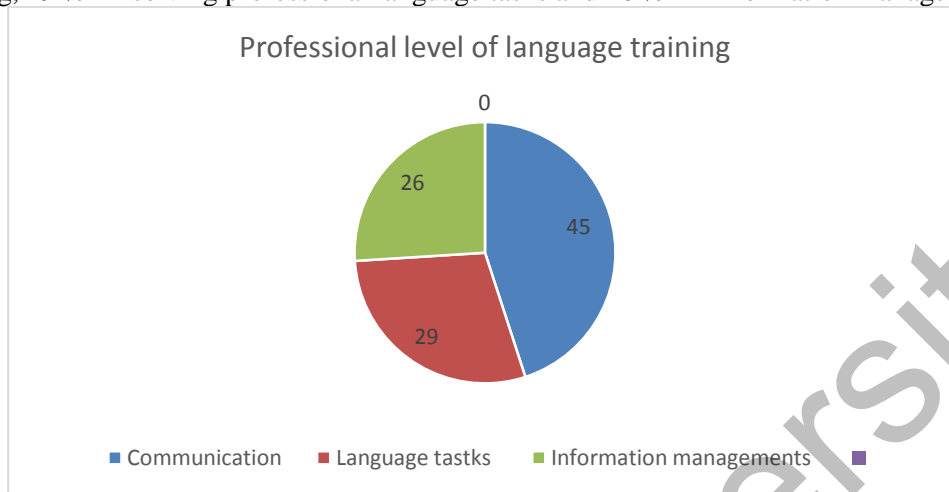
Figure 1. Professional level of language training

At the professional level of language training 45 % of respondents consider business communication as the main thing, 29 % — solving professional language tasks and 26 % — information management (Fig. 1).