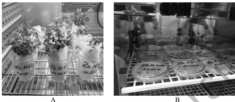
Figure 1. The test plants in plastic cups (A) and in Petri dishes (B)

The work was carried out at the Research Center for Biotechnology and Eco-Monitoring. The nanoparticles of zinc were synthesized at the Research Center for Ion Plasma Technologies and Modern Instrumentation of Karagandy University of the name of academician E.A. Buketov.